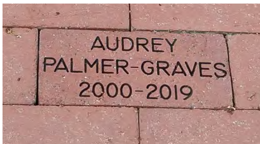
Example of an engraved brick